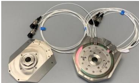
Flat Form Factor Design

Developed for the In-Vessel Viewing System (IVVS) of ITER, the technology is used to take extremely precise measures and have direct feedback on what's happening inside the vacuum chamber. The system operates based on CWDM (Coarse Wavelength Division Multiplexing): two wavelengths of 850nm and 1300nm are sent via an optical multimode fiber to probe the rotation of the encoder disk. This intensity modulated light is guided back by a secondary multimode fiber, then, an optical demultiplexer resolves the optical power signals and reconstructs the directional aware quadrature signal. One additional pair of fibers is used to sense the absolute index on the encoder disk.